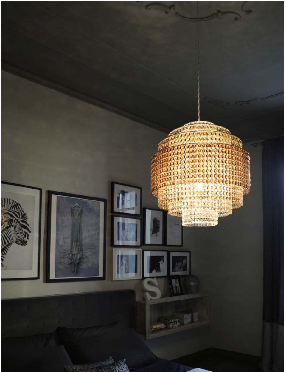
in the picture Phebo circular

Via Fratelli Vivarini 7, I-20141 Milano, Italy tel +39 02 895 023 42 fax +39 02 895 409 74 info@lollimemmoli.it www.lollimemmoli.it